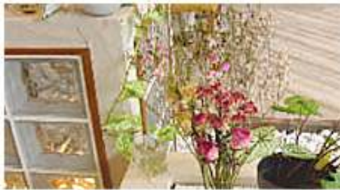
Dried flowers in LOHAS studio