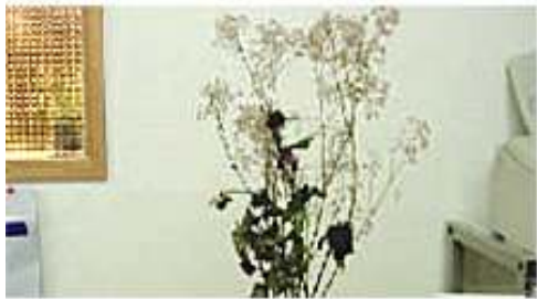
Dried flowers in the ordinary house

Another experiment was done to produce dried flowers from fresh flowers with the same stump. In the LOHAS studio fresh flowers became dry with vivid natural color ! In the ordinary house, flowers became dry as an usual kind of dried flowers. Their staff engaged in this experiment says he could not recognize the the ones in LOHAS Studio as "dried flowers" since the colour looked so natural.