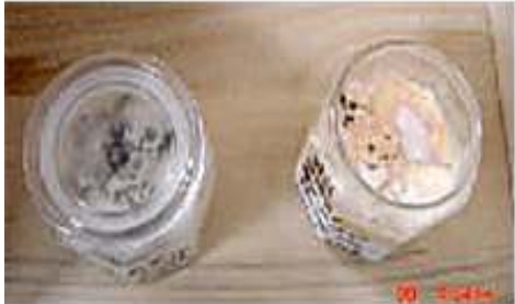
Bottles of milk in an ordinary house

At LOHAS studio with EM Diatomite (right) and ordinary house (left), bottles of a few kinds of milk were placed to find what would happen after that. In 3 weeks' time, the milk in the LOHAS studio changed to cheese, and the ones in the ordinary house became rotten with foul odor and fungus.