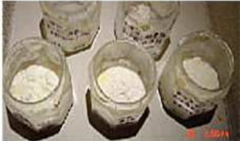
Bottles of milk in LOHAS studio

Another experiment was done to produce dried flowers from fresh flowers with the same stump. In the LOHAS studio fresh flowers became dry with vivid natural color ! In the ordinary house, flowers became dry as an usual kind of dried flowers. Their staff engaged in this experiment says he could not recognize the the ones in LOHAS Studio as "dried flowers" since the colour looked so natural.