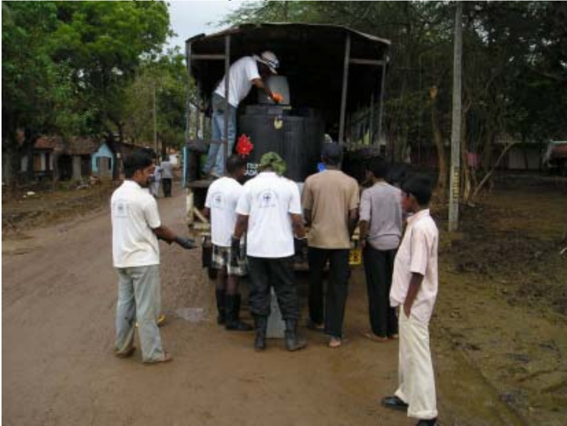
6)Cleaning Gardens through E.M.