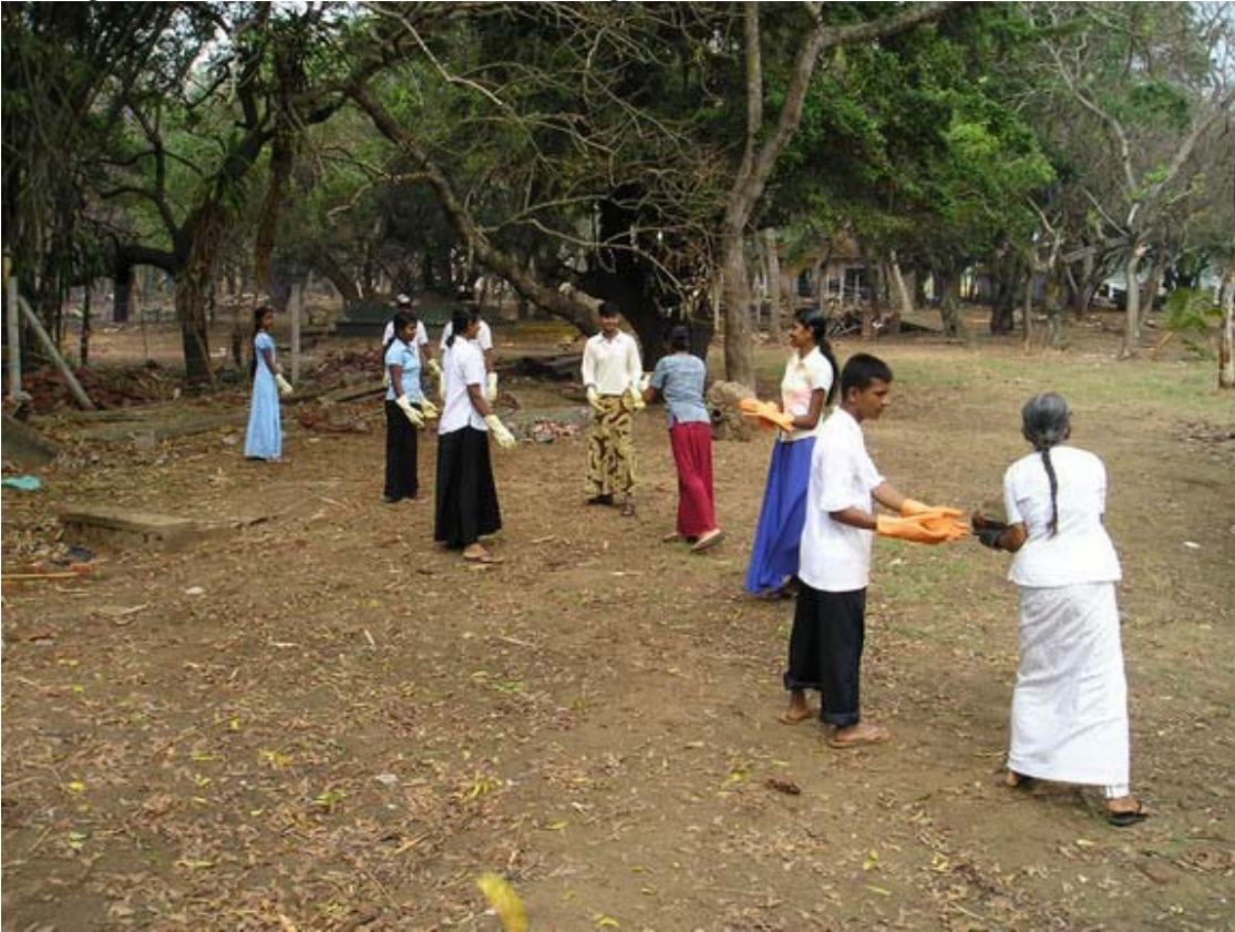
8) E.M. spraid volunteer group L.S.K.F seinen group.