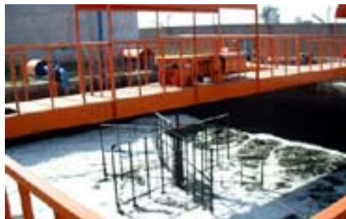
Sprinkling of EM in the equalization tank

The equalization tank is provided with aerators and agitators. The effluent is kept for about 8 - 16 hours under constant mixing and aeration. The effluent is pumped out mechanically into the primary settlement tank (sedimentation tank), where it is kept at a relatively quiescent state. The settle able solids are allowed to settle. The supernatant effluent still loaded with contaminations is allowed to fall into the nearby open drain. The slurry from the sedimentation tank is pumped out mechanically into the decanter. From where after some period the slurry is pumped into the sludge lagoons. The beds of these lagoons have been provided with coarse sand to dewater the slurry. As soon as the water is drained out, the sludge flakes are formed and become handle able. These are removed from the lagoons manually and are disposed of indiscriminately in nearby places.