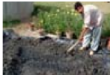
Mixing of EM