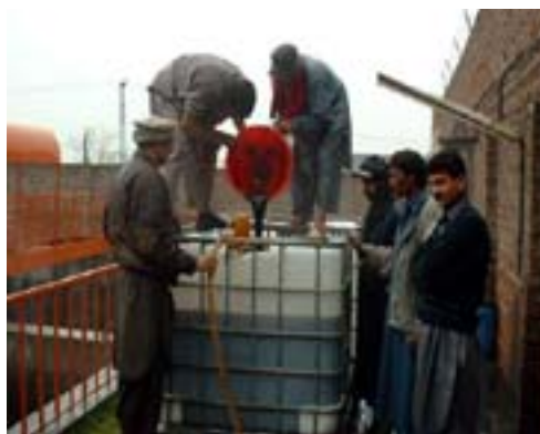
Preparation of EM

On 31 st January 2003 three plastic tanks of 1-ton capacity each were washed thoroughly by the labor of SLW. EM extended was prepared in these plastic tanks and were capped. About 72 hours were given to the effective microorganisms to propagate.