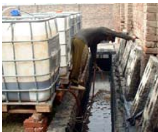
Application of EM

To start with 1m 3 EM extended was applied immediately to the effluent at a point in the medium size drain, where it has just reached after screening through the fine sieve, before entry into the equalization tank. After which a suitable quantity of EM extended was continued to be dripped daily from 09:00 to 22:00 hours at the same point in the medium size drain.