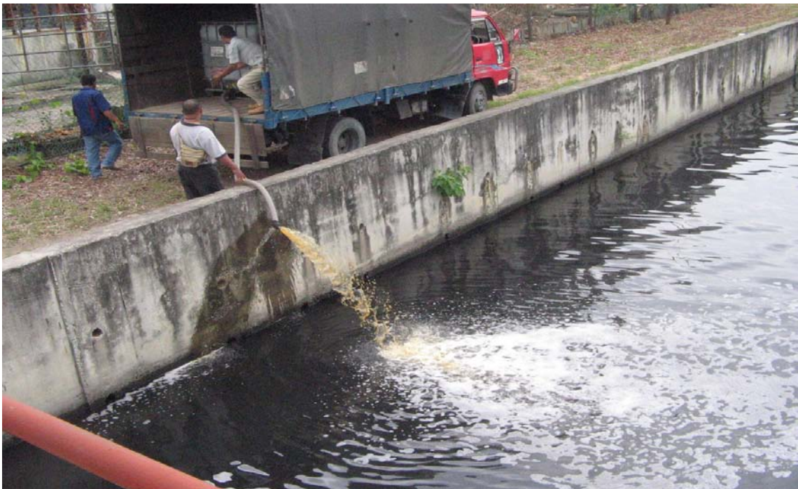
Applying EM Activated Solution